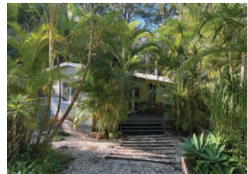
10 Hillside Parade, Elizabeth Beach $825k