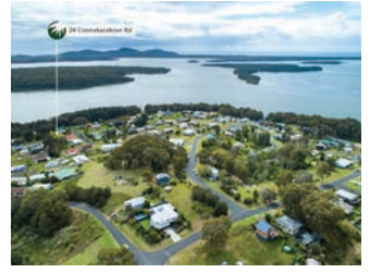
Lot 92, 28 Coonabarabran Road, Coomba Park $255k Land size 556sqm