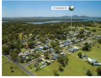
Lot 123, 47 Yallambee St Coomba Park $180k Land size 733sqm