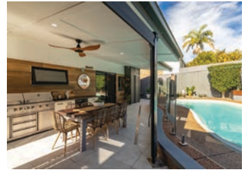
45 Patsys Flat Road, Smiths Lake $1.350m