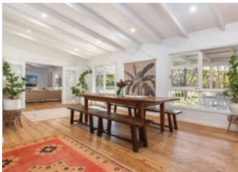
23 Racecourse Road Bungwahl $1.54m