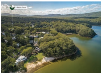
Lot 99, 5 Karen Place Smiths Lake $260k