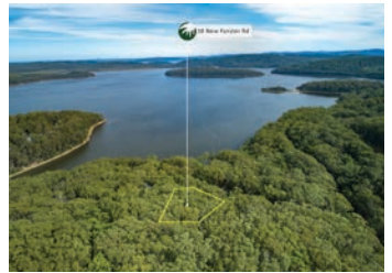
Lot 19, 38 New Forster Rd Smiths Lake Guide $595k