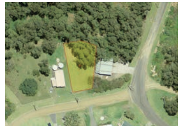
Lot 151, 3 Warramutty St Coomba Park $199k