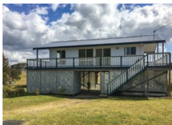
19 Warramutty Street Coomba Park $525k