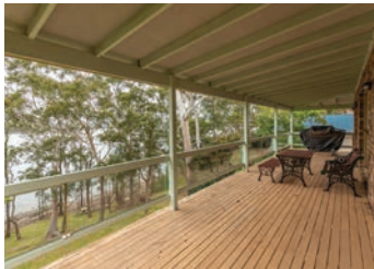
83 Amaroo Drive Smiths Lake $1.4m