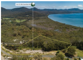
Lot 31, 96 Coomba Road Charlotte Bay $780k