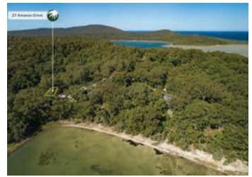
27 Amaroo Drive Smiths Lake Contact Agent