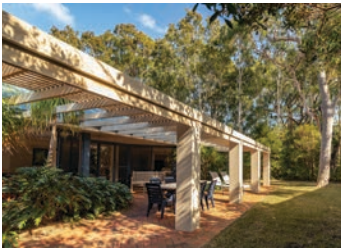
44 Belbourie Crescent Boomerang Beach Contact Agent