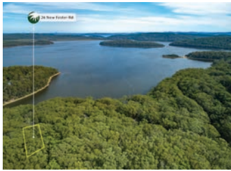
26 New Forster Road Smiths Lake $345k