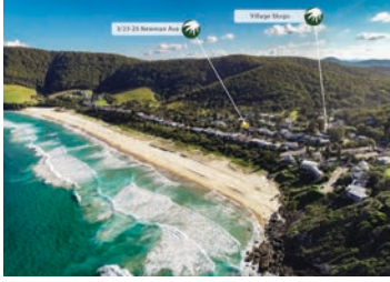
3/23 Newman Avenue Blueys Beach $1.090m