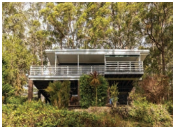
169 Amaroo Drive Smiths Lake $991k