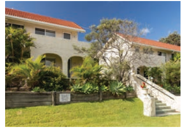
32/13 Banksia Street Blueys Beach $495k