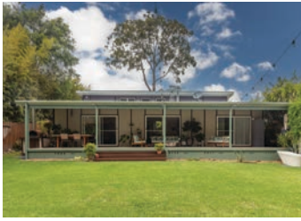
25 Tropic Gardens Drive, Smiths Lake Contact Agent