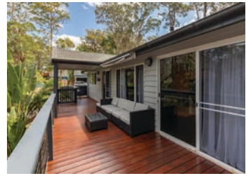
46 Amaroo Drive, Smiths Lake Guide $770k