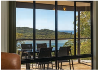
20 Patsys Flat Road, Smiths Lake $1.395m