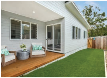
12B Reef Circuit Blueys Beach $700k