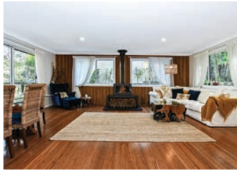
187 Amaroo Drive, Smiths Lake Guide $950k