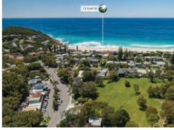
12 Croll Street Blueys Beach $1.350m