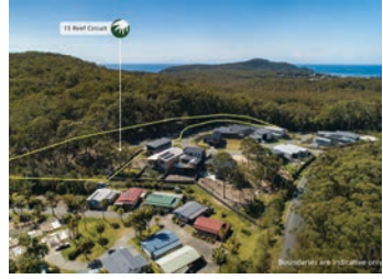
Lot 1, 15 Reef Circuit, Blueys Beach $850k