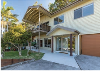
8 Gordon Crescent Smiths Lake $850k