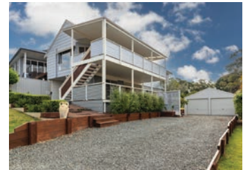
3 Harcourt Crescent Smiths Lake Guide $995k