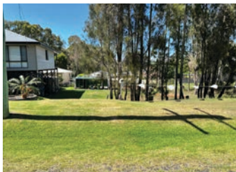
Lot 68, 76 Coonabarabran Road Coomba Park $225k