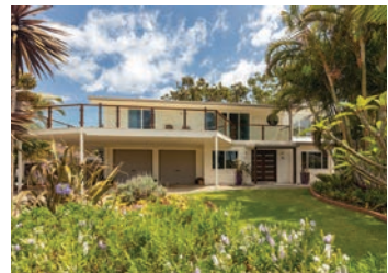
17 Boomerang Drive Boomerang Beach $1.650m