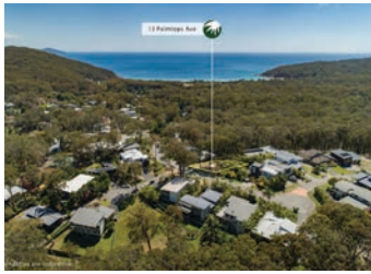
13 Palmtops Avenue, Elizabeth Beach