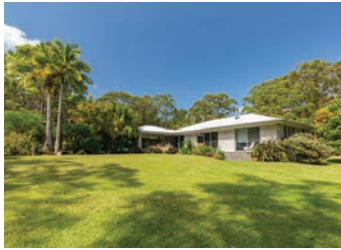
44 Coomba Road Charlotte Bay $1.9m