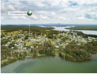
Lot 17, 77 Coonabarabran Road Coomba Park $290k Land size 658sqm