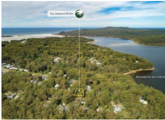
Lot 25, 152 Amaroo Dr Smiths Lake $415k