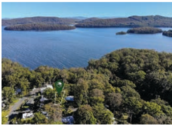
Lot 71, 5 Keith Crescent Smiths Lake $290k