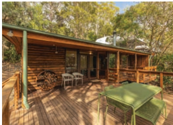
149 Amaroo Drive Smiths Lake $830k