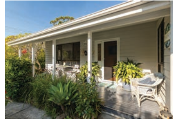
60 The Jack Smiths Lake $775k