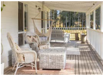
23 Racecourse Road Bungwahl $1.54m