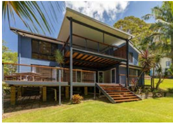
7 Matthew Road Smiths Lake $1.050m