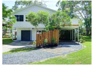
27 Belbourie Crescent Boomerang Beach $1.535m