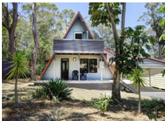
13 Fourth Ridge Road Smiths Lake $575k