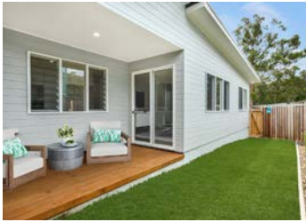
12B Reef Circuit Blueys Beach $700k