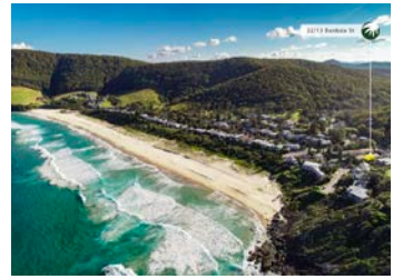
32/13 Banksia Street Blueys Beach $495k