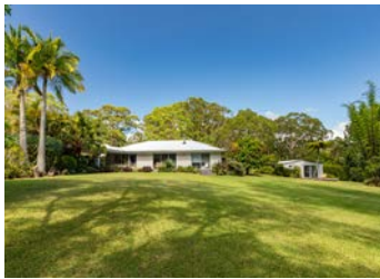
44 Coomba Road Charlotte Bay $1.9m