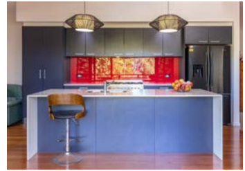
35 Macwood Road Smiths Lake $799,500k