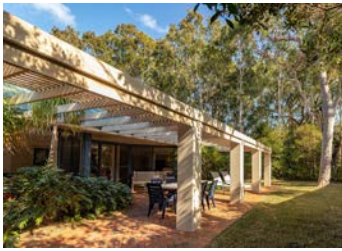
44 Belbourie Crescent Boomerang Beach Contact Agent