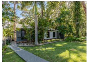
29 Second Ridge Road Smiths Lake $565k