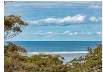
3 Harcourt Crescent Smiths Lake $1.2m