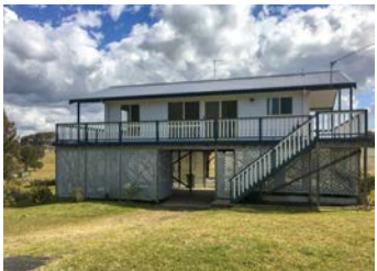
19 Warramutty Street Coomba Park $525k