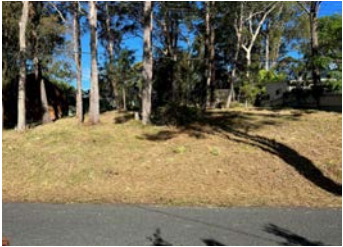
Lot 25, 152 Amaroo Dr Smiths Lake $415k