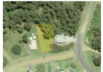
Lot 151, 3 Warramutty St Coomba Park $199k