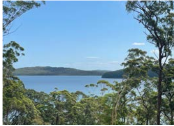
Lot 19, 38 New Forster Rd Smiths Lake Guide $595k