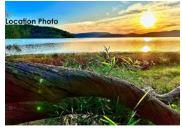
2 New Forster Rd Smiths Lake $350k