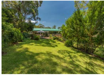
12 Matthew Road Smiths Lake Guide $875k