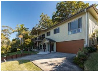
8 Gordon Crescent Smiths Lake $890k