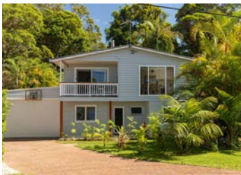
11 The Jack Smiths Lake $839k