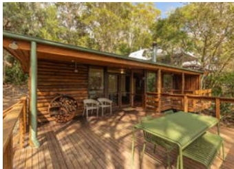
149 Amaroo Drive Smiths Lake $850k