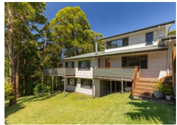
15 Gordon Crescent Smiths Lake $1.275m