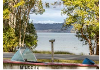
6 The Lakes Way Tarbuck Bay $680k