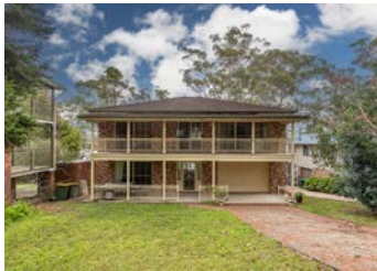
83 Amaroo Drive Smiths Lake $1.4m