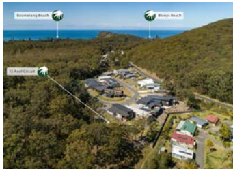
Lot 1, 15 Reef Circuit Blueys Beach $850k