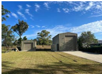
Lot 2, 4 Wangaree St Coomba Park Guide $325k