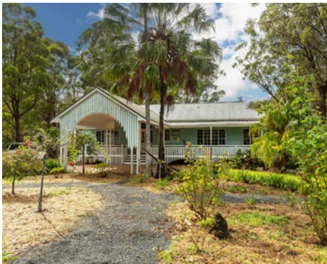
610 Coomba Road Whoota $900k