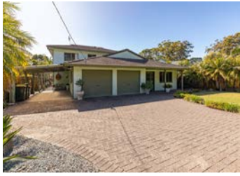
69 Macwood Road Smiths Lake $910k