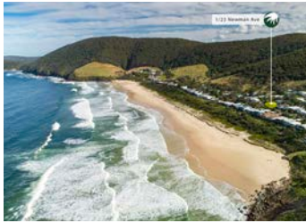
1/23 Newman Avenue Blueys Beach $1.045m