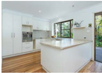
25 Amaroo Drive Smiths Lake $799k