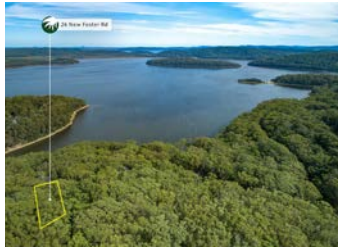
26 New Forster Road Smiths Lake $345k