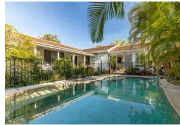
60 The Jack Smiths Lake Guide $795k